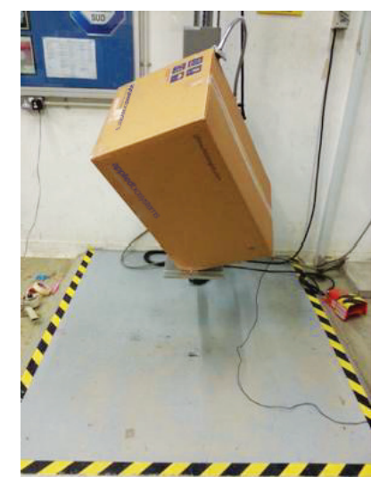
Figure 3. ProFlex PCR System shown in shipping box drop testing.

Table 1 shows the test methods employed for the Applied Biosystems<sup>™</sup> Veriti<sup>™</sup>, ProFlex<sup>™</sup>, and SimpliAmp<sup>™</sup> thermal cyclers prior to their commercial release. Together, these methods help ensure that you receive the highest-quality instrument. Additional information about our test methods is available upon request.